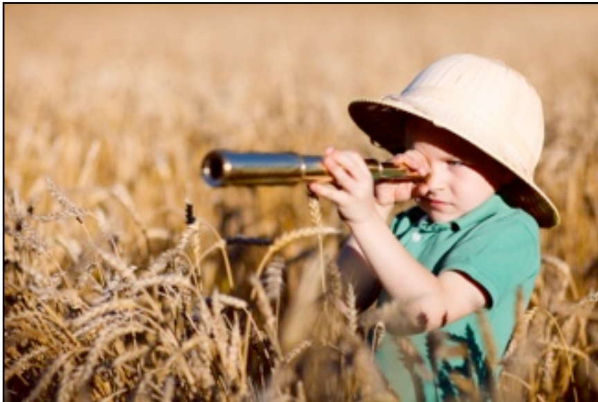
September 15th, 2009

By providing non-partisan, objective information about the voting records of Nebraska's state senators